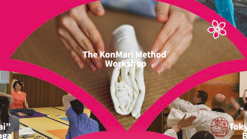
The KonMari Method Workshop