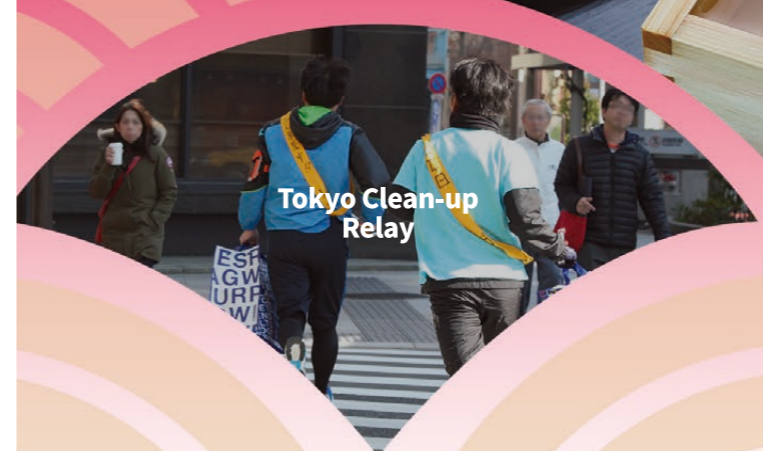
Tokyo Clean-up Relay