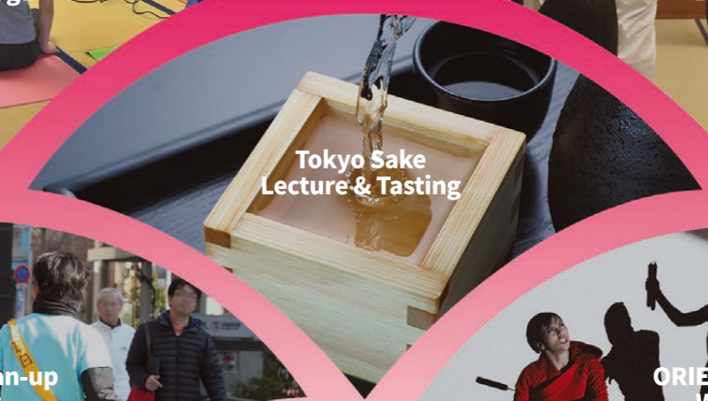
Tokyo Sake Lecture & Tasting