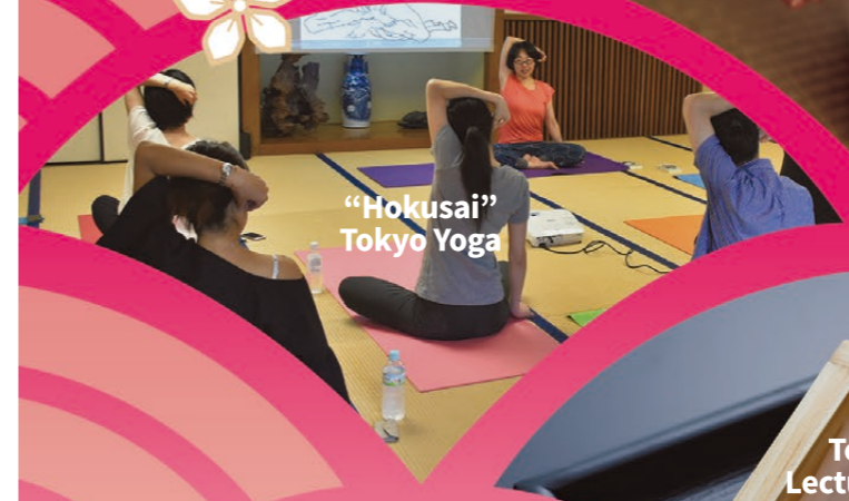
“Hokusai” Tokyo Yoga