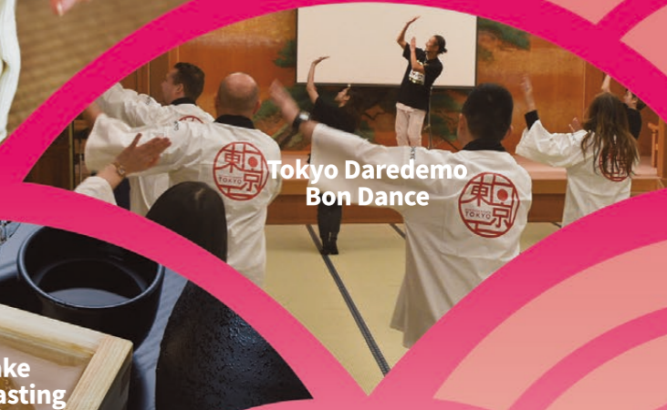
Tokyo Daredemo Bon Dance