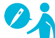
Monitoring temperature before work